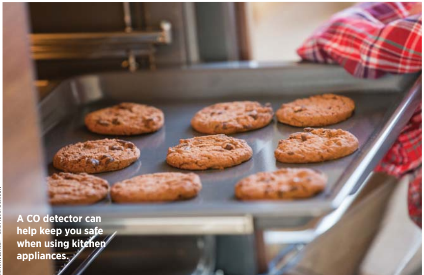
A CO detector can help keep you safe when using kitchen appliances.

Test CO detectors at least once a month by pressing the TEST button. Alarm batteries should be replaced in accordance with the manufacturer’s instructions, at least once a year. If an alarm “chirps” or “beeps” to indicate low batteries, they should be replaced immediately. The life span of CO alarms varies and should be replaced in accordance with the manufacturer’s instructions.