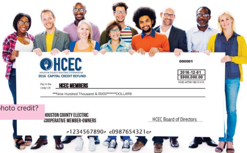
The Board of Directors retired $900,000 in Capital Credits. Watch for a credit on your December bill!

We believe that being a part of this community is a valuable gift, and we hope you feel the same way. Merry Christmas and happy holidays to everyone in your family, from everyone at your co-op family.